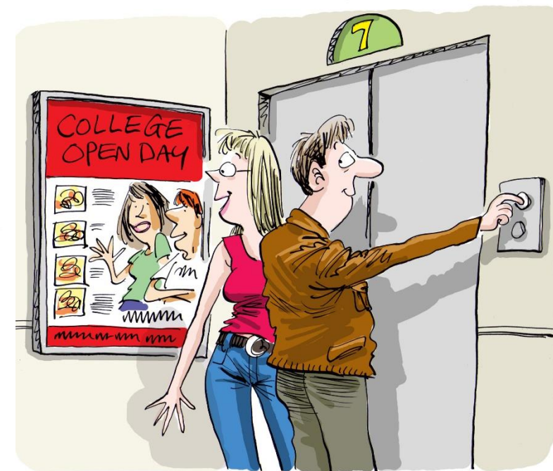
Lift Lobbies ...captive spots!