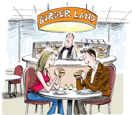
...grabbing a bite to eat