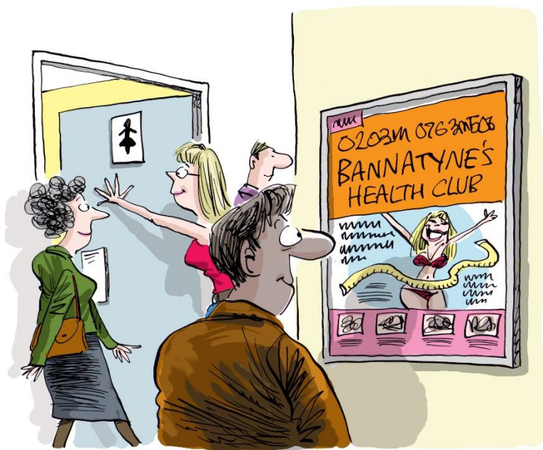
Outside busy toilets ...busy dwell areas!