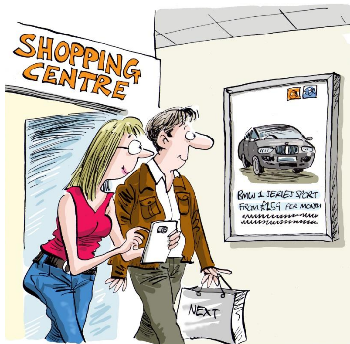
Main entrances and exits ...high traffic area!