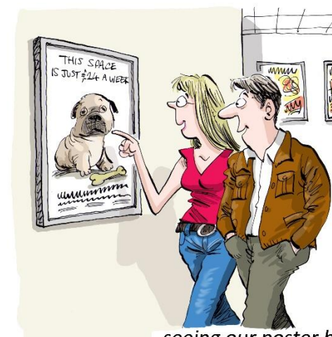
...seeing our poster boards