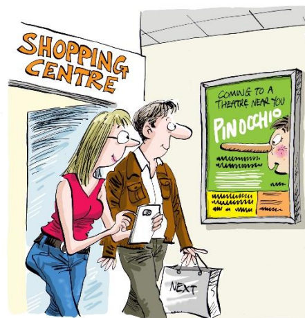
...seeing our poster boards again on the way out