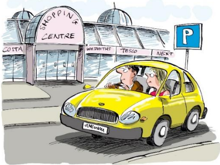
...parking outside the centre