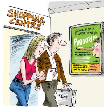
...seeing our poster boards again on the way out