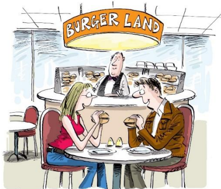
...grabbing a bite to eat