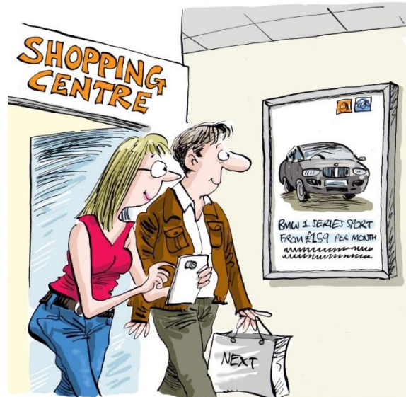
Main entrances and exits ...high traffic area!