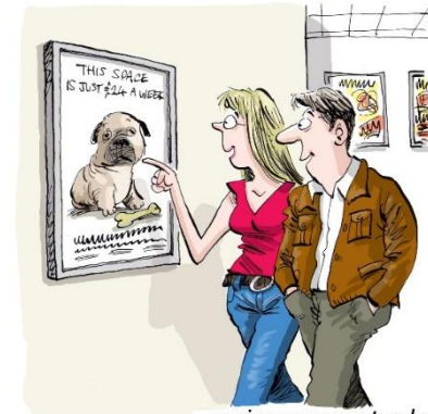
...seeing our poster boards