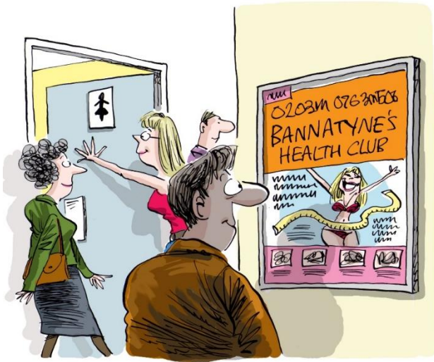
Outside busy toilets ...busy dwell areas!