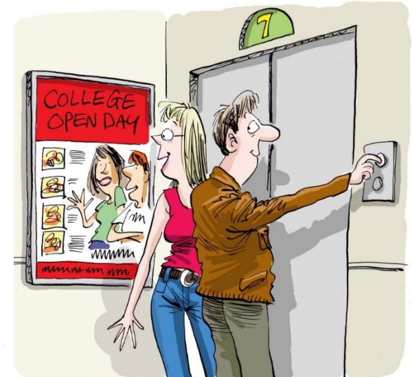
Lift Lobbies ...captive spots!